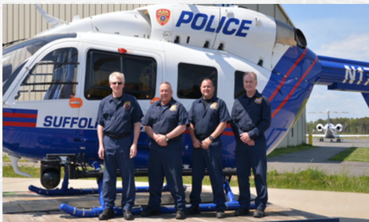
SUFFOLK AME UNION MEMBERS-SPECIAL PATROL BUREAU AVIATION UNIT.