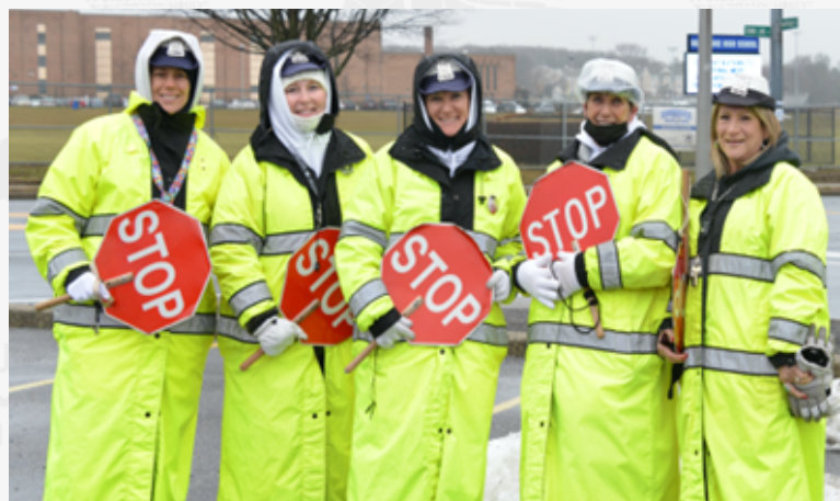
SUFFOLK AME UNION MEMBERS-CROSSING GUARDS.