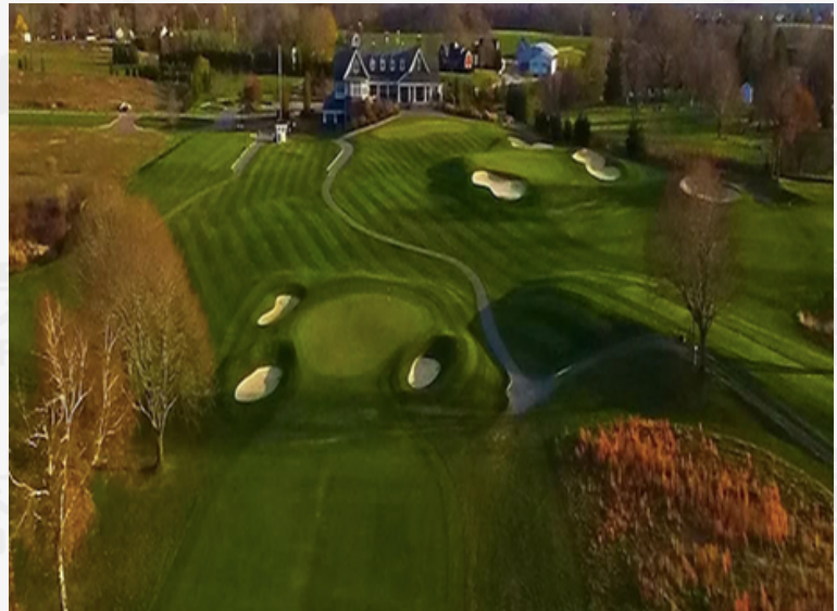
THE 2022 SUFFOLK AME GOLF INVITATIONAL AT THE BAITING HOLLOW COUNTRY CLUB- BAITING HOLLOW, NY.