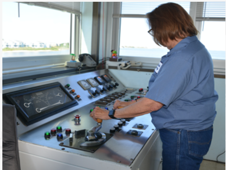
SUFFOLK AME UNION MEMBER-BRIDGE OPERATOR