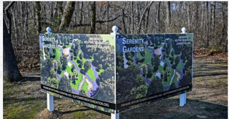
A RENDERING OF SITE PLANS AT SERENITY GARDENS. CREDIT: JOHN ROCA.